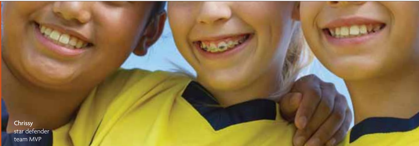
Chrissy star defender team MVP

big win, big smile compared to that game the dentist is easy